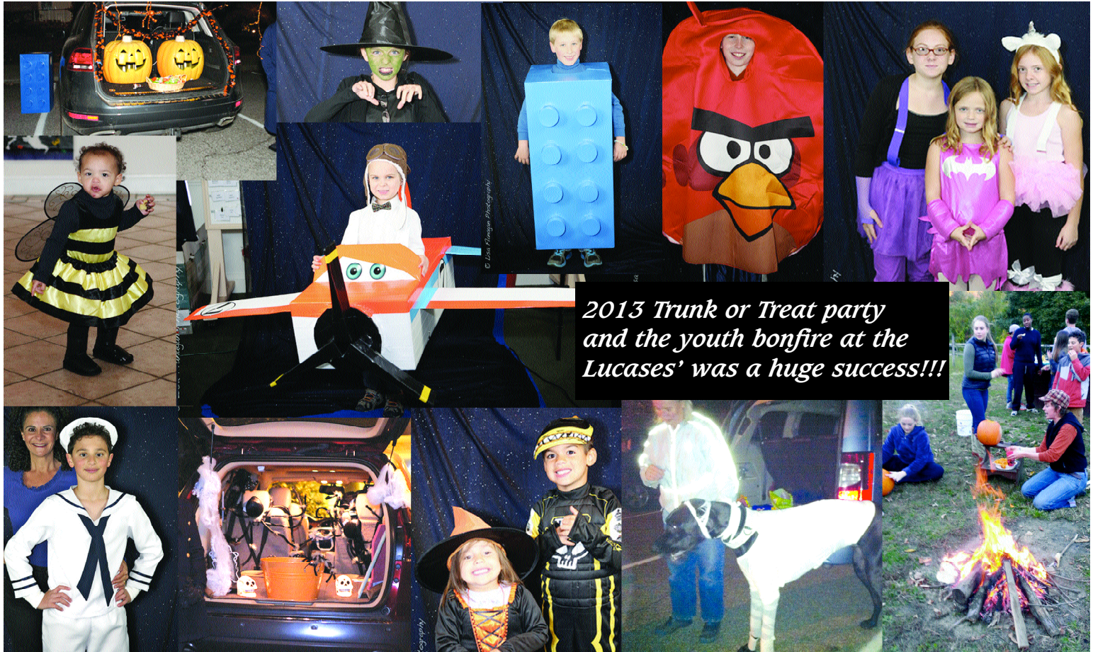
2013 Trunk or Treat party and the youth bonfire at the Lucases' was a huge success!!!